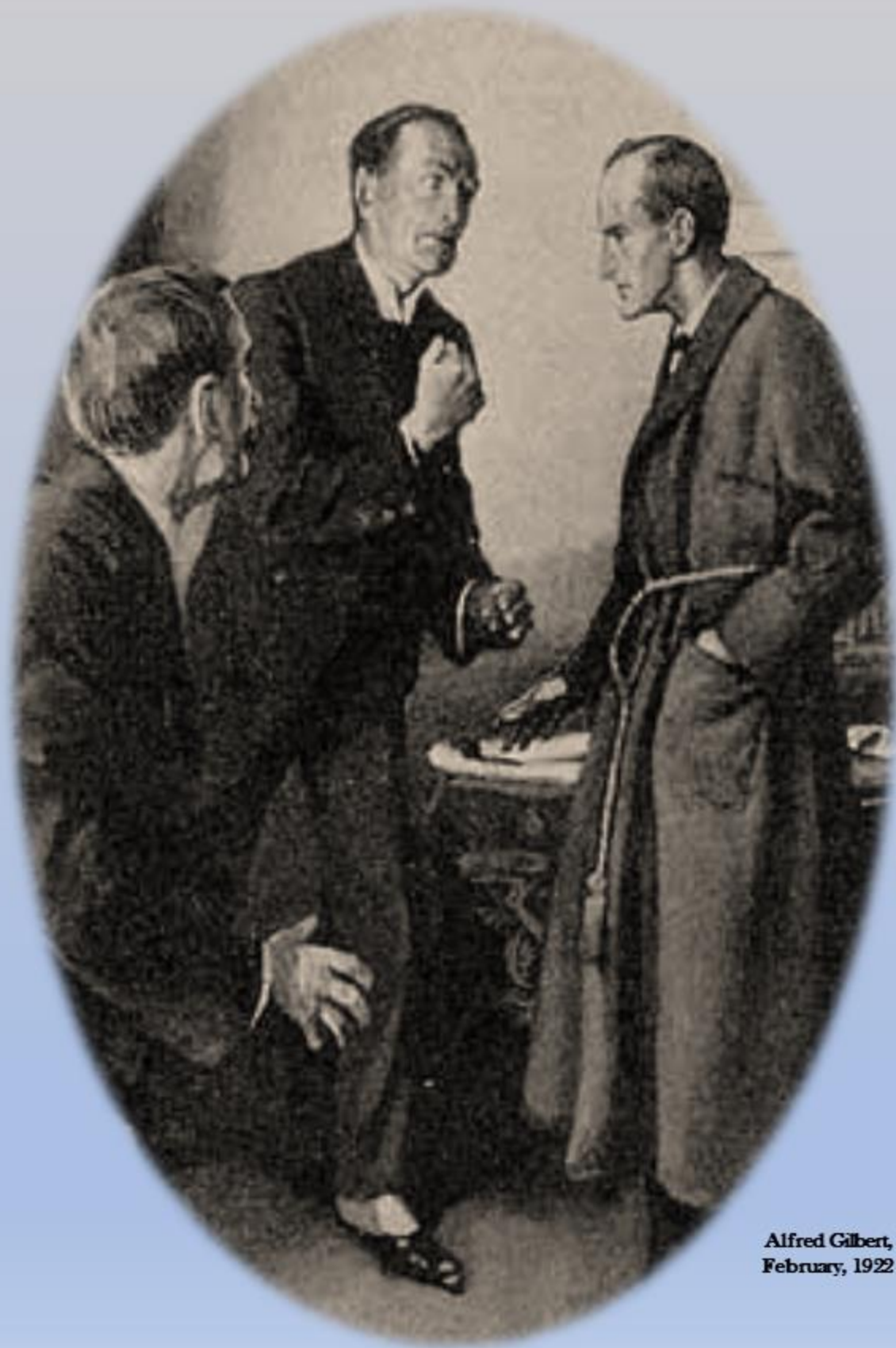
Alfred Gilbert, February, 1922