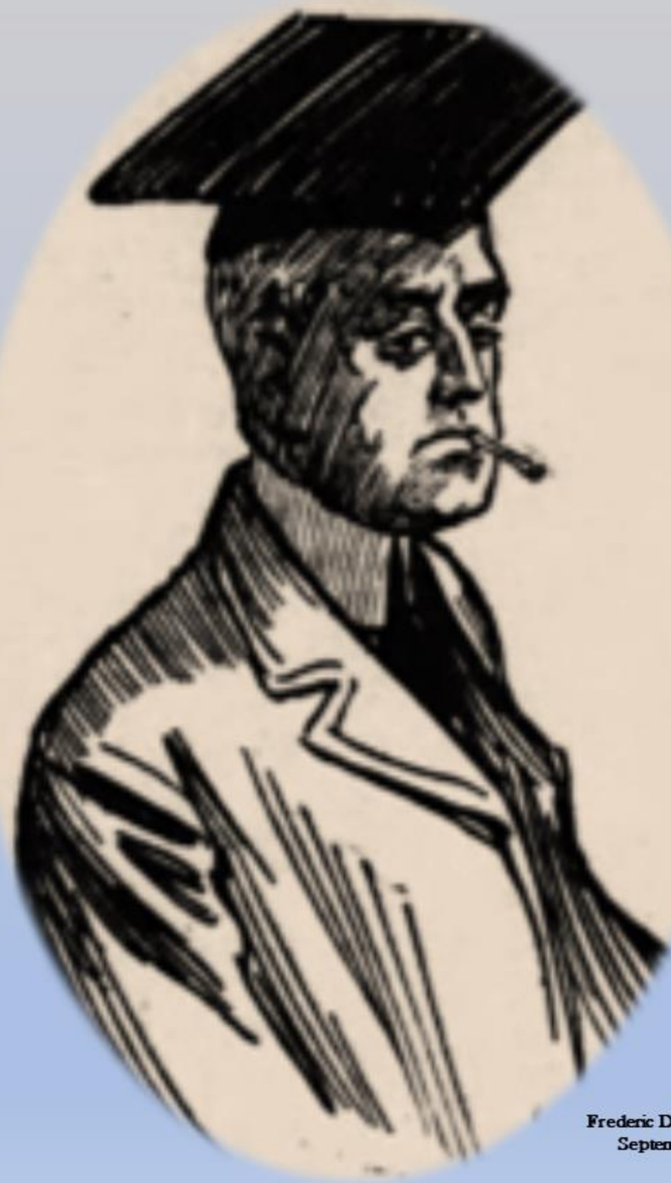
Frederic Dorr Steele, September, 1904