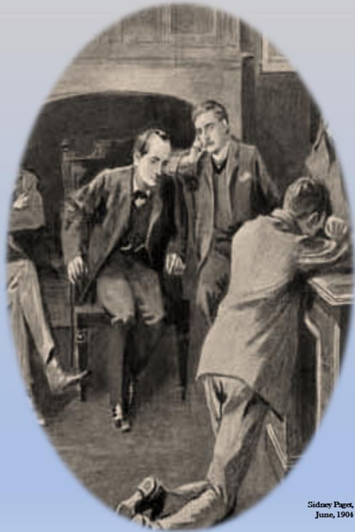
Sidney Paget, June, 1904