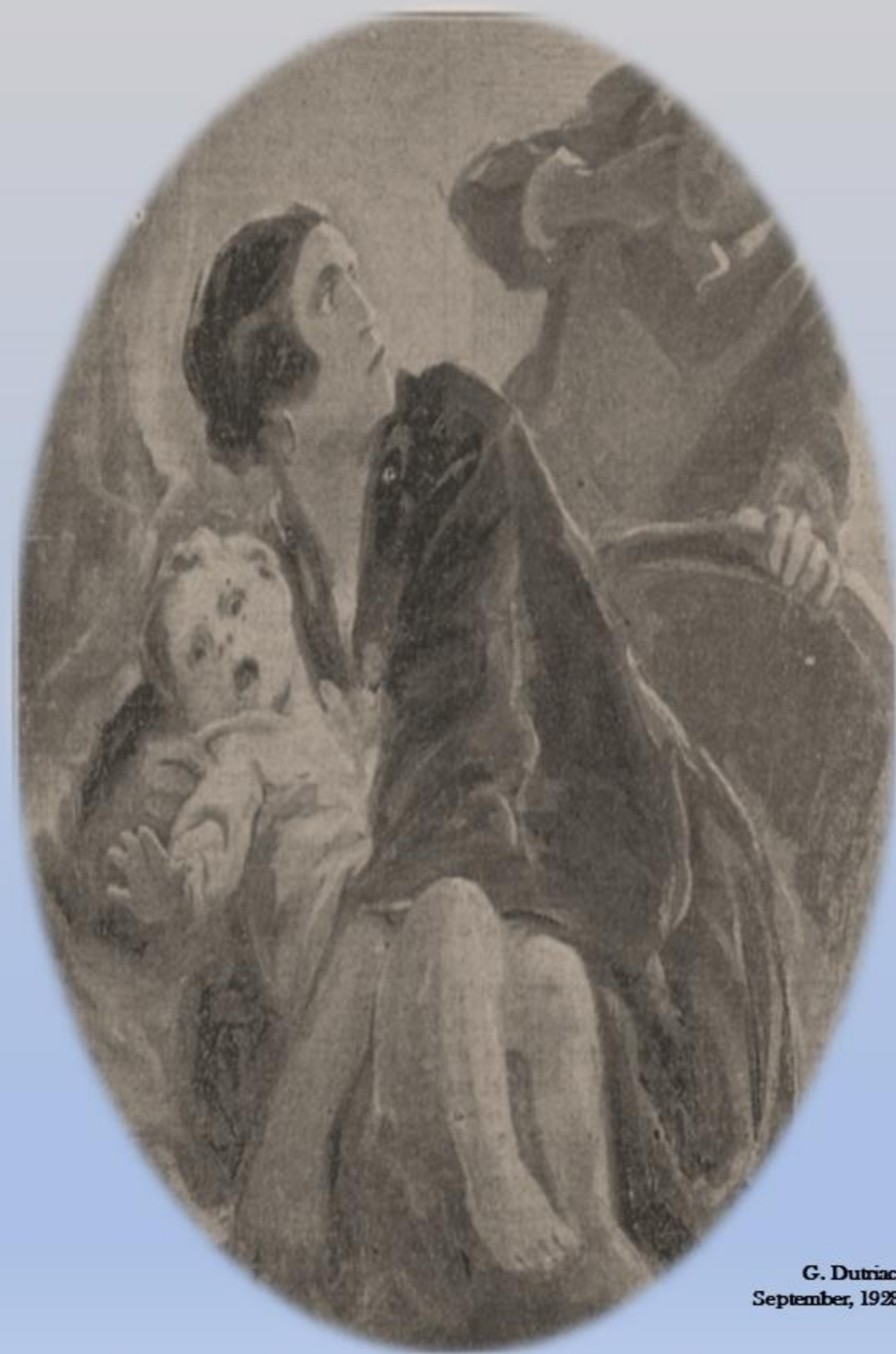
G. Dutrac, September, 1928