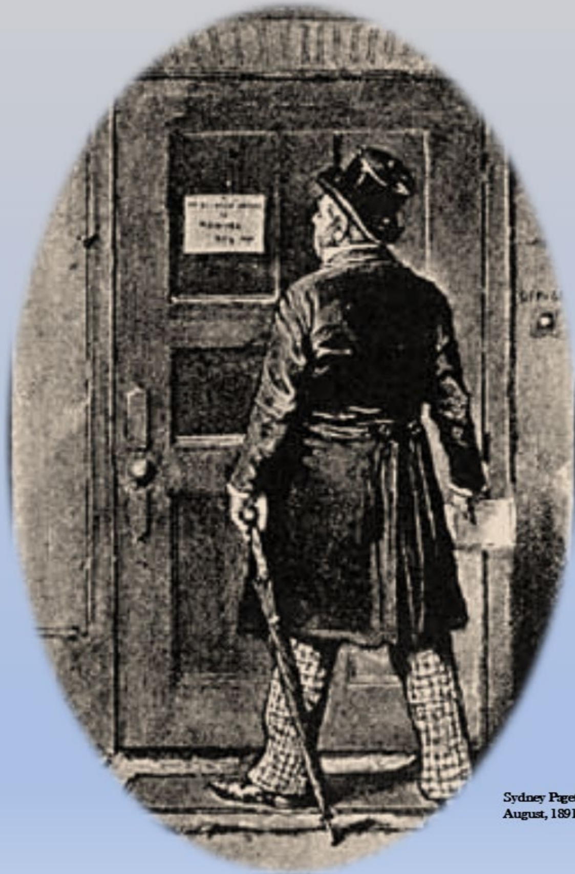
Sydney Paget August, 1891