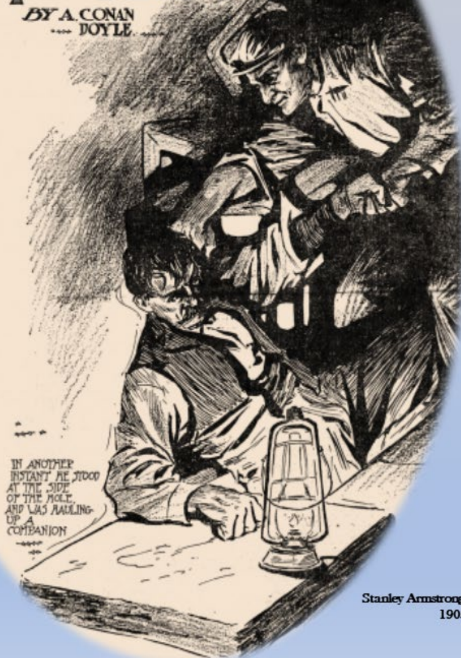
Stanley Armstrong, 1905