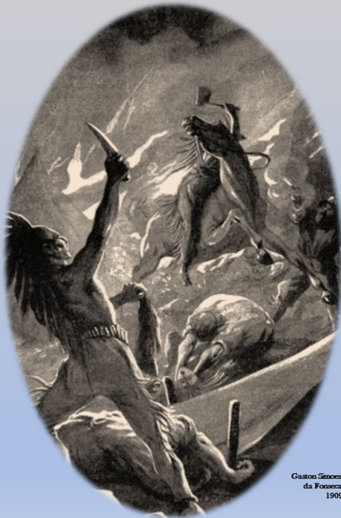
Gaston Simoes da Fonseca, 1909