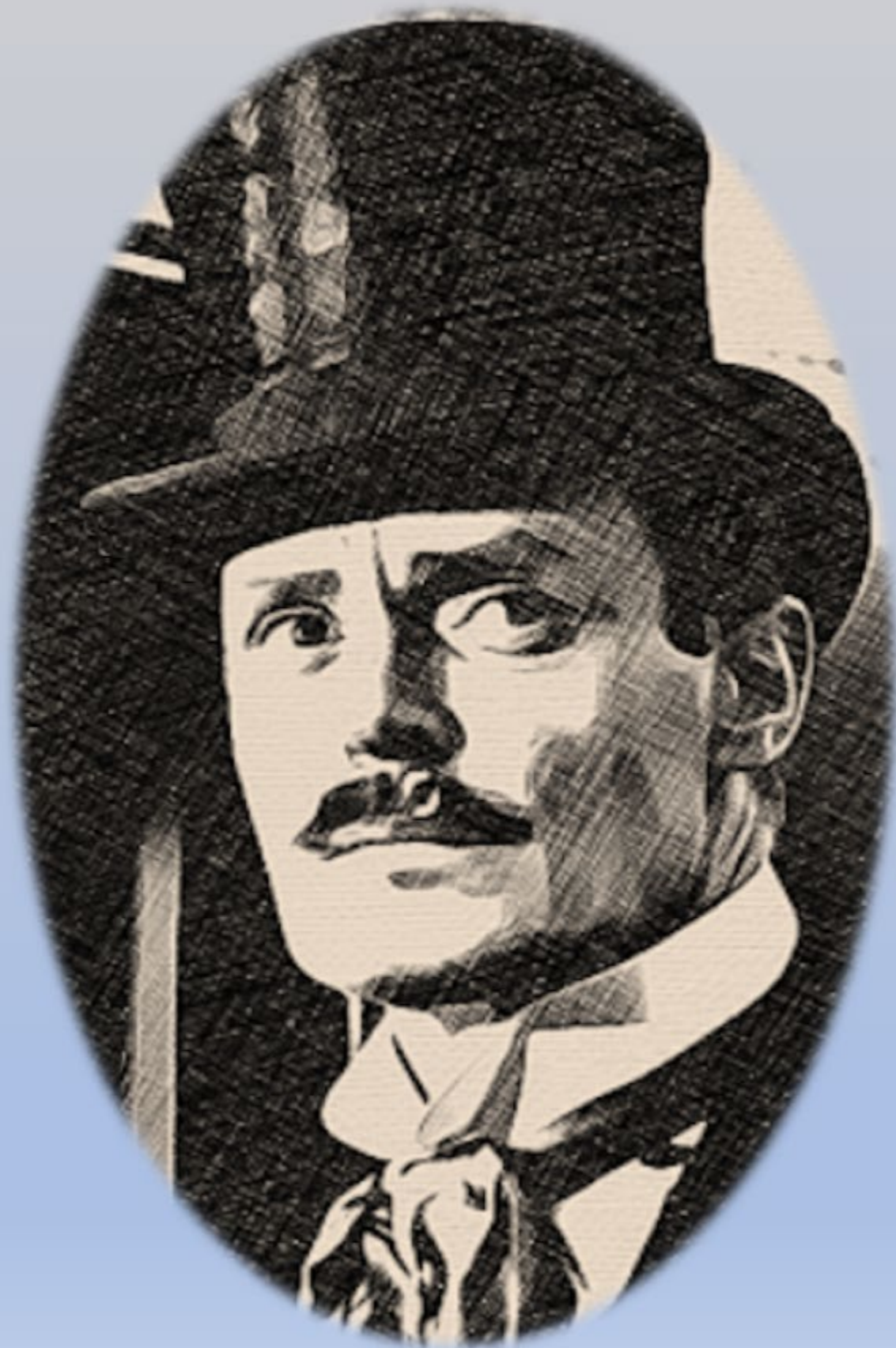
Lord Robert St. Simon