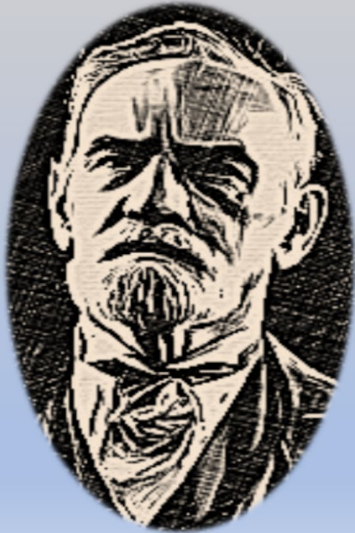
Duke of Balmoral