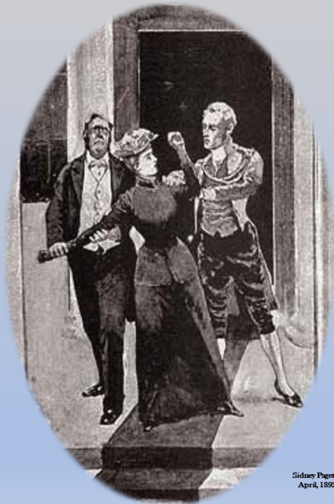
Sidney Paget, April, 1892