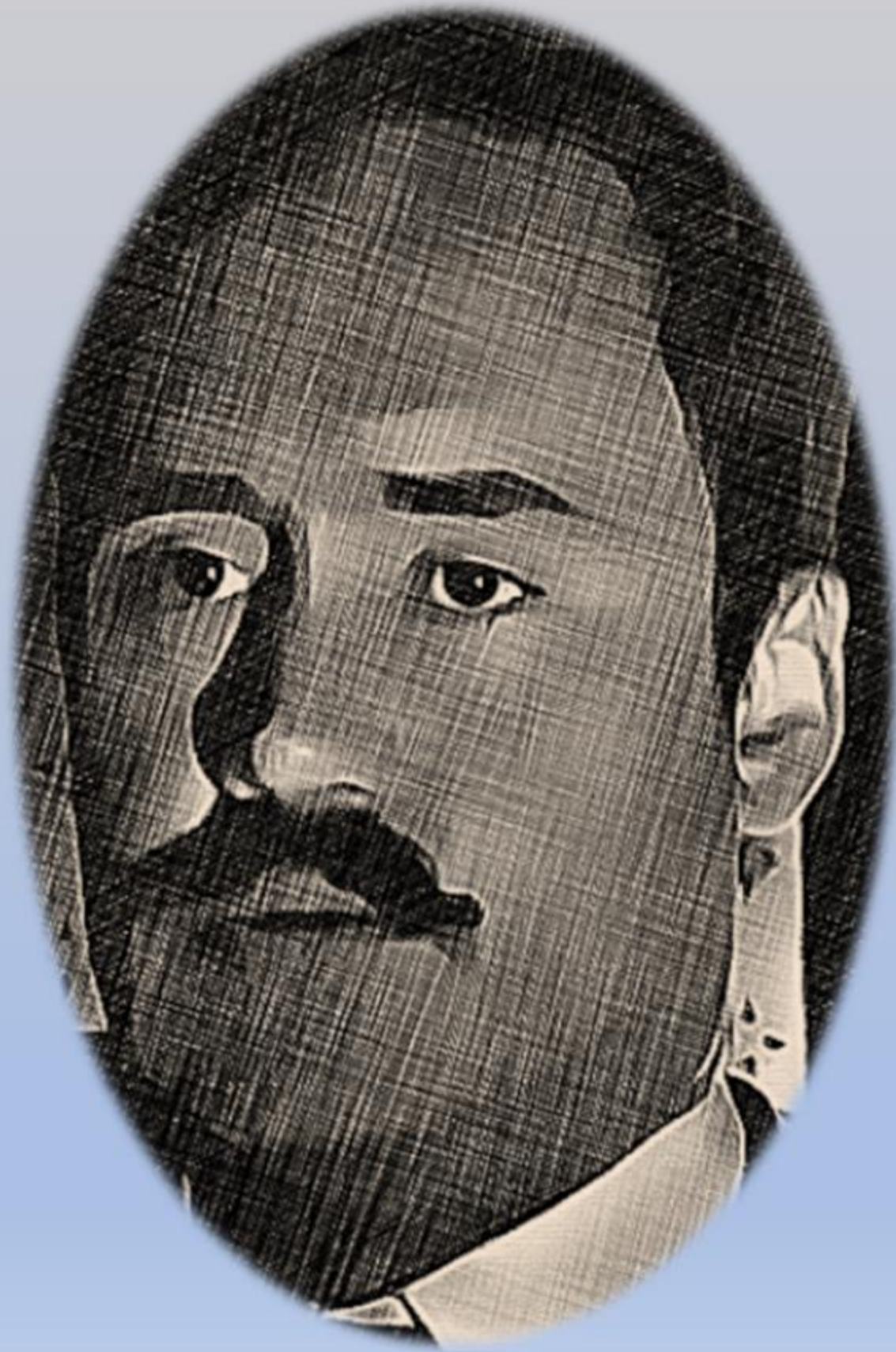
Inspector Stanley Hopkins