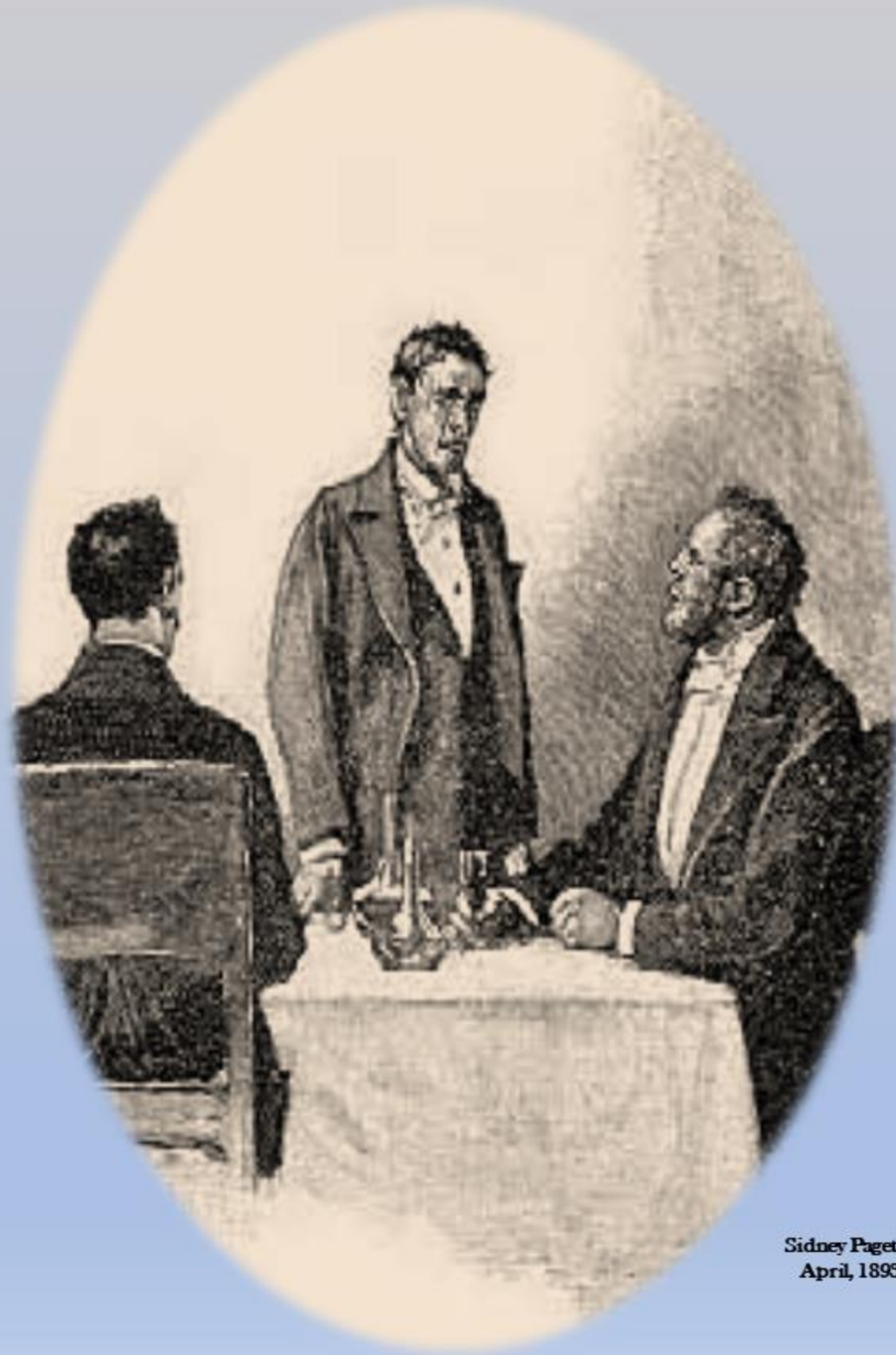
Sidney Paget, April, 1893