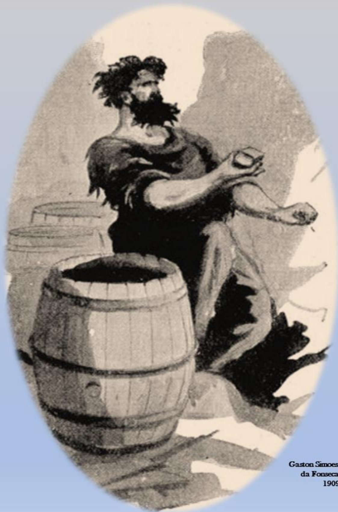
Gaston Simoes da Fonseca, 1909