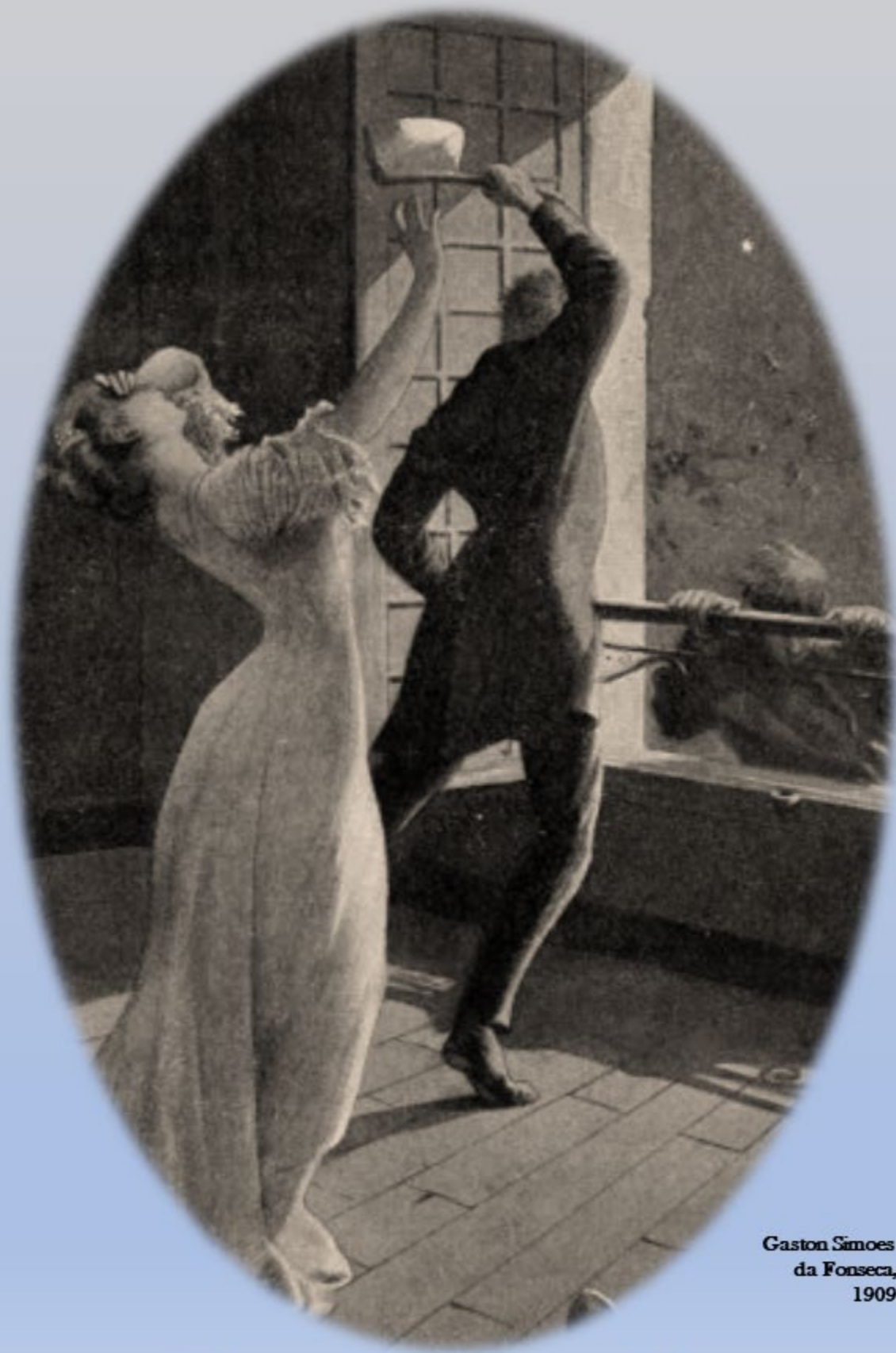
Gaston Simoes da Fonseca, 1909