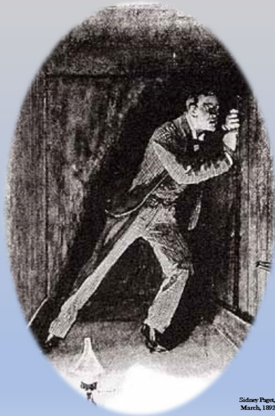
Sidney Paget, March, 1892