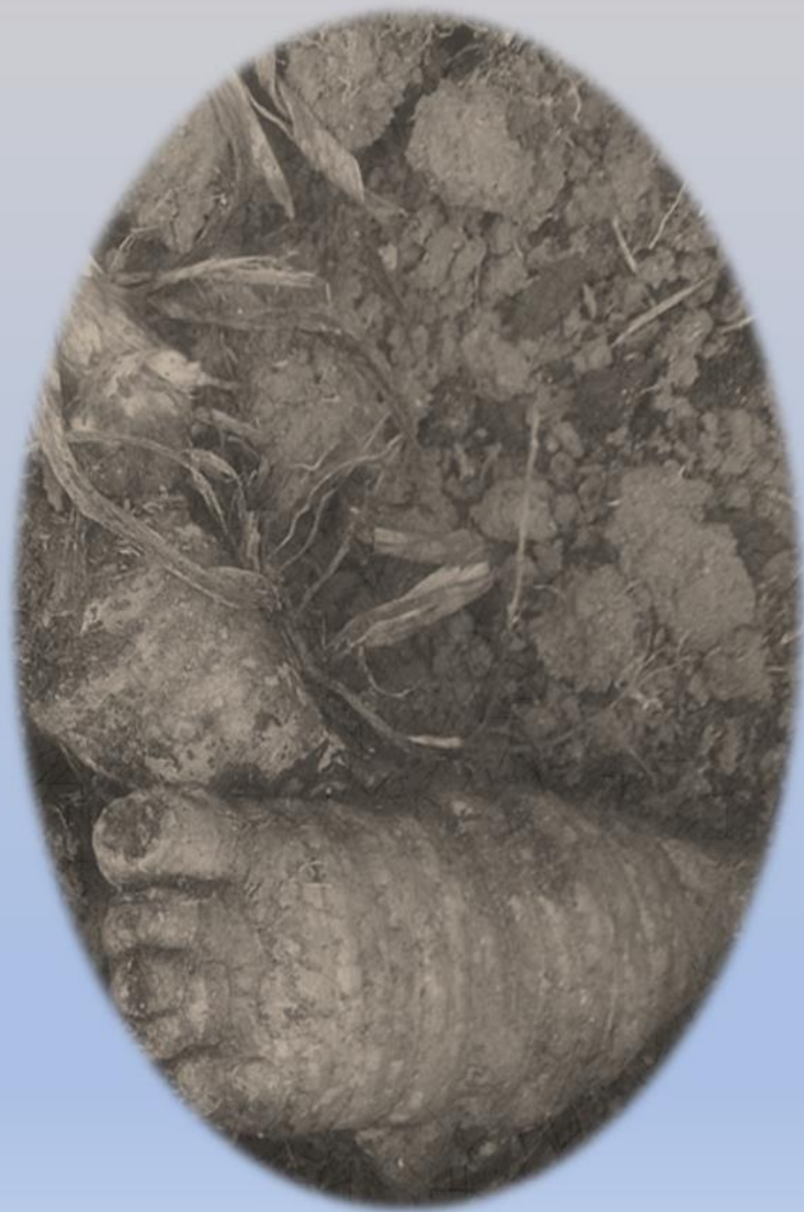
Radix Pedis Diaboli