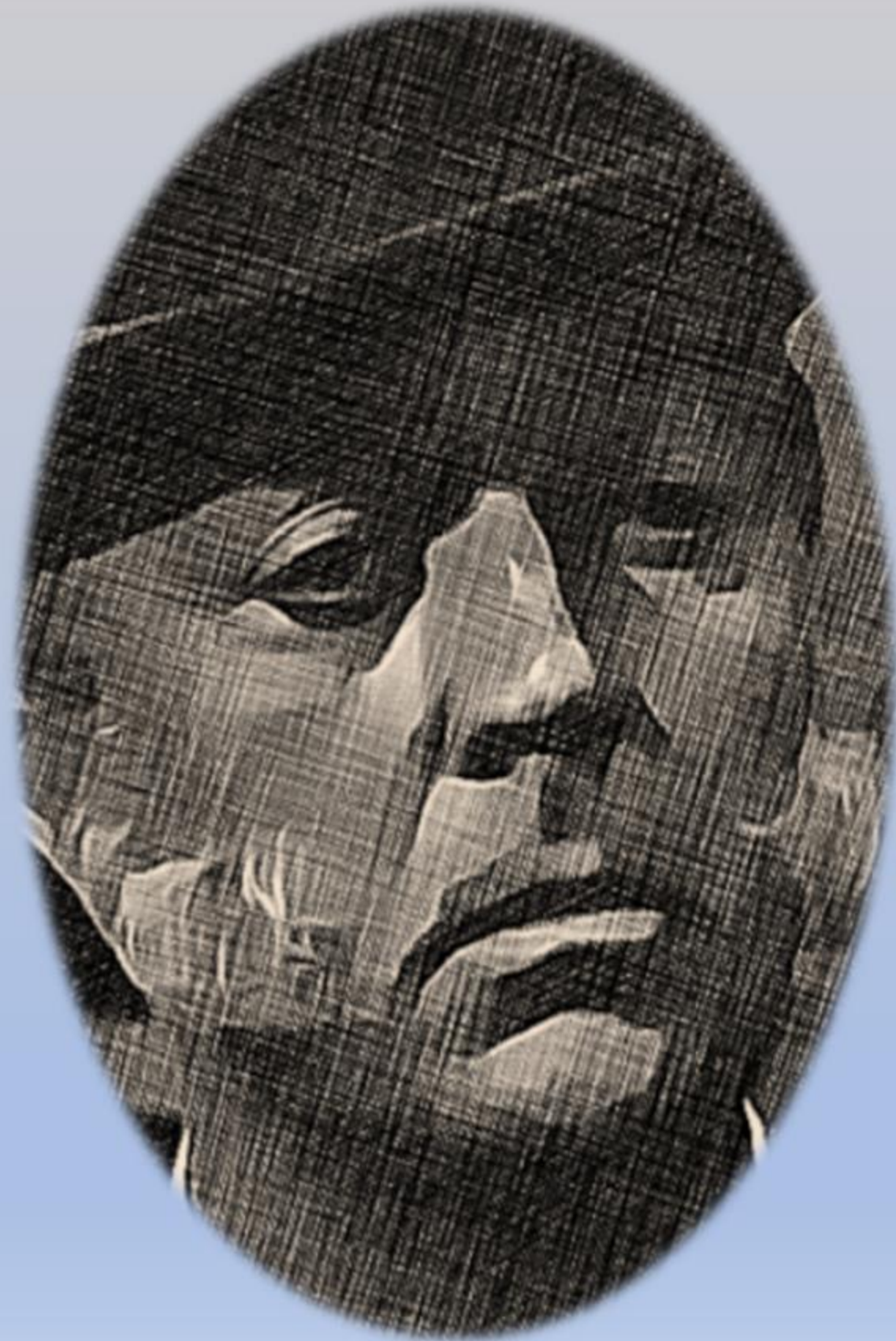
Inspector Tobias Gregson