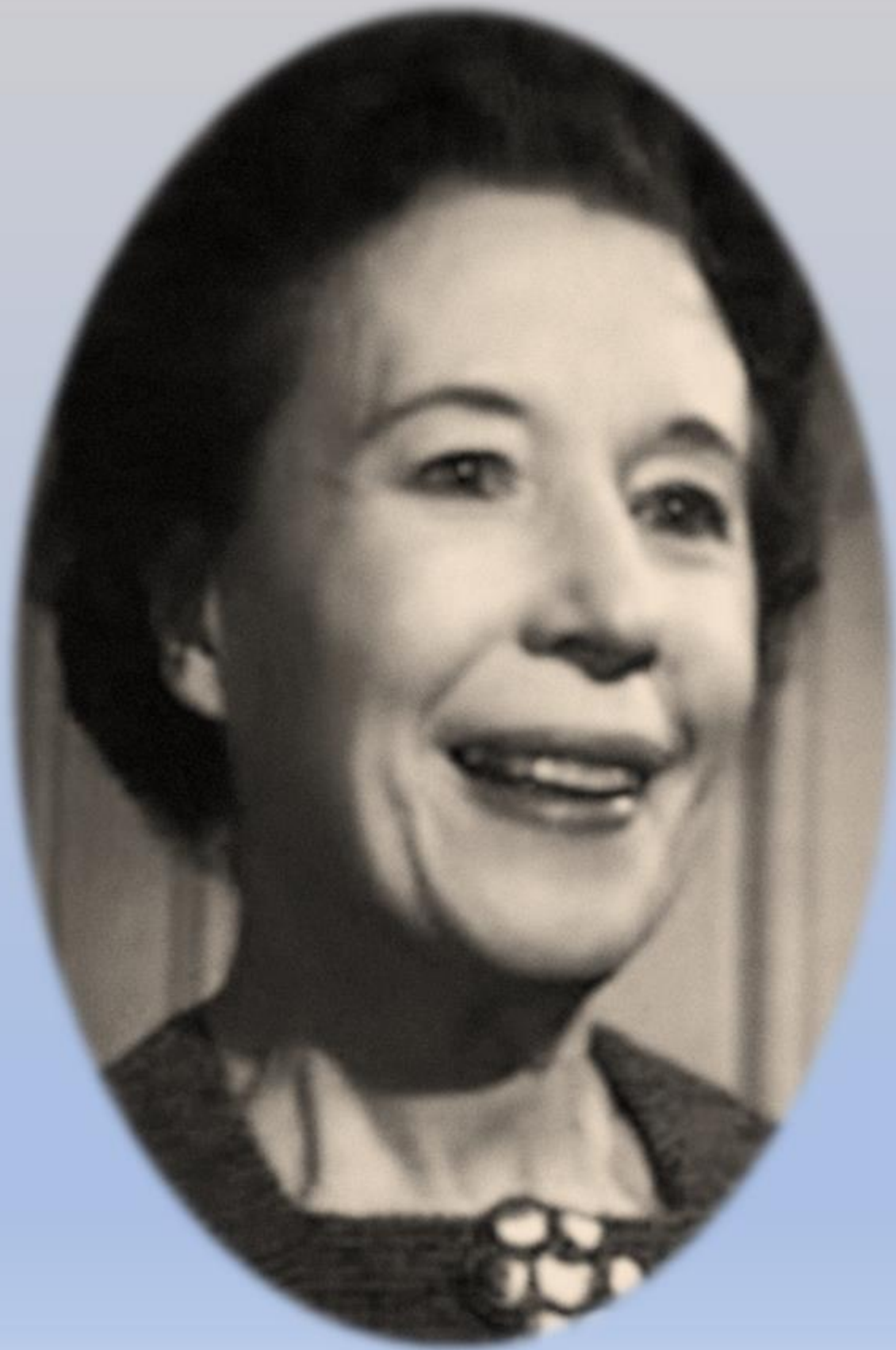
The Landlady (Mrs. Hudson)