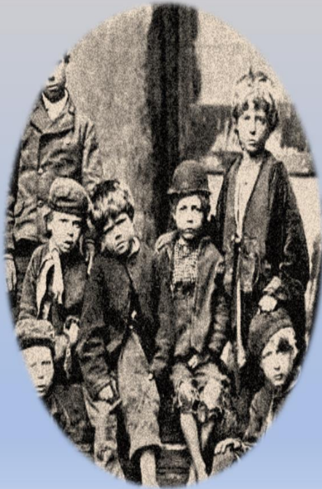
Baker Street Irregulars