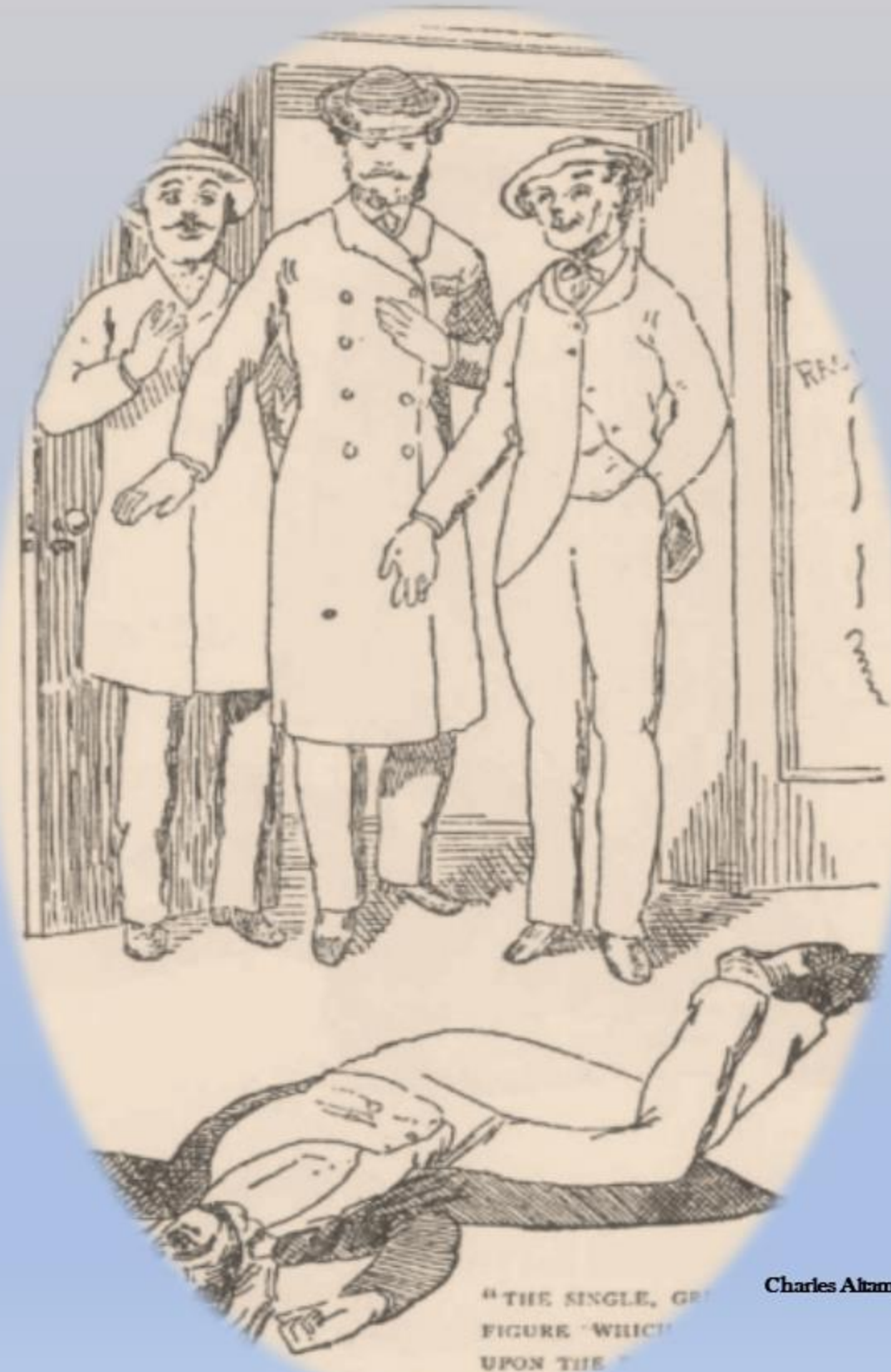
“THE SINGLE, GRAY FIGURE WHICH UPON THE” Charles Altamont Doyle 1888