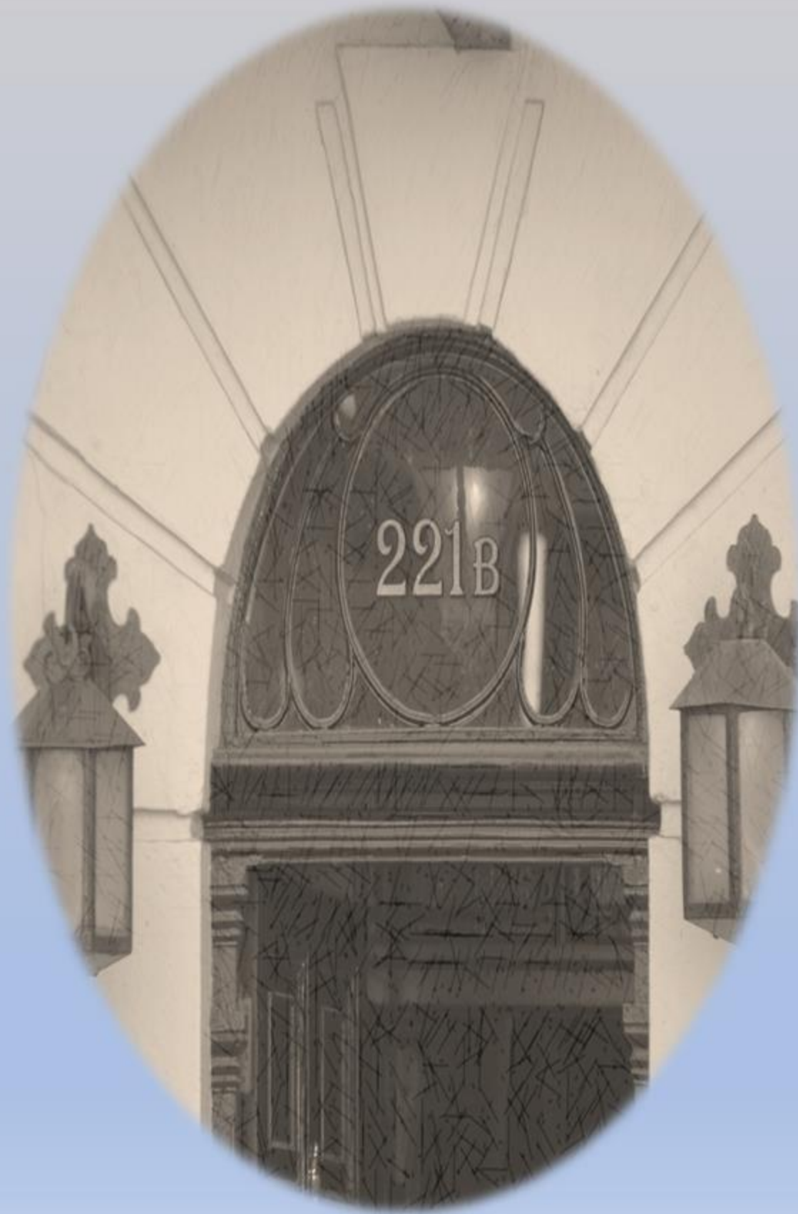
221 B Baker Street