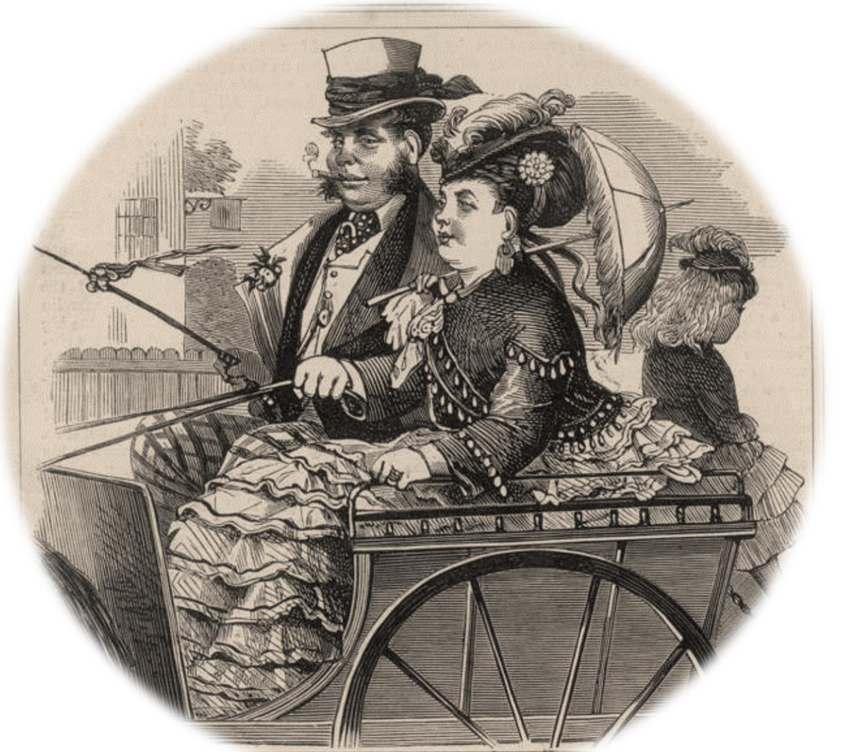
THE PUBLICAN'S "MISSIS"