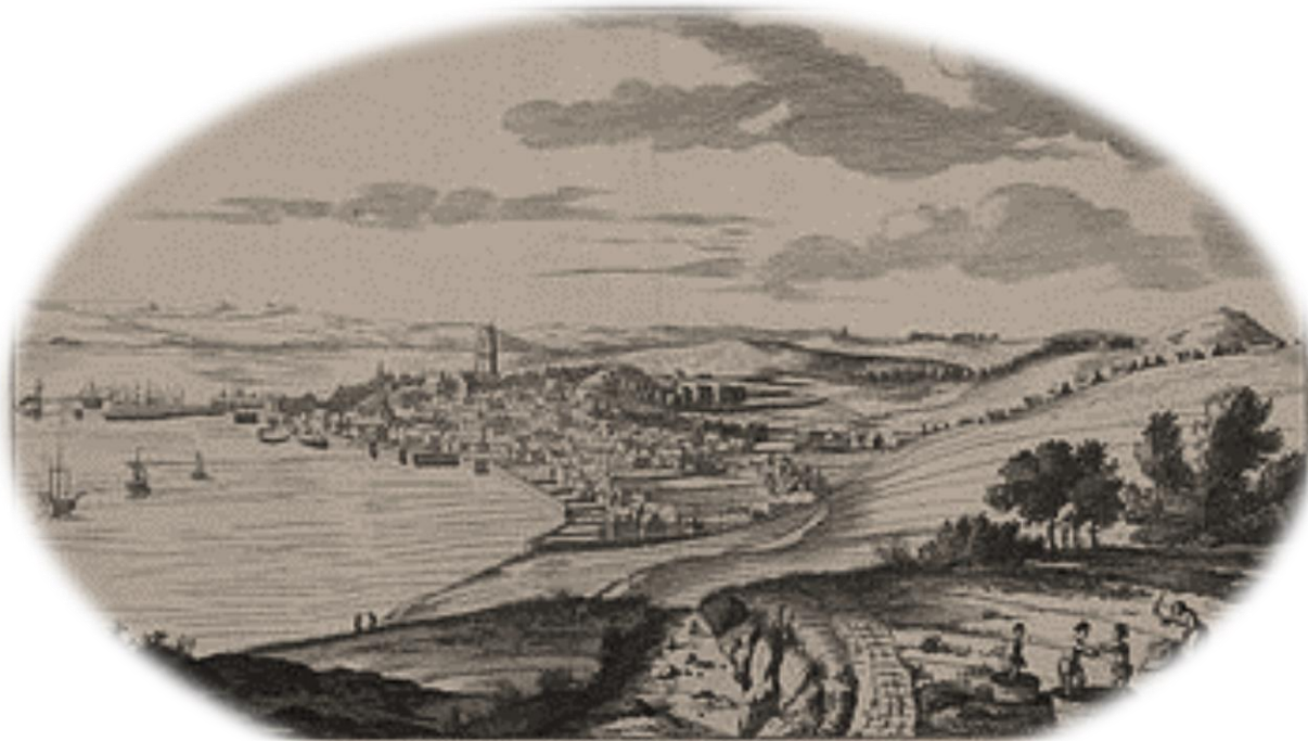
...The Prospect of the East.

...THE RISE IN DEMAND FOR BRITISH-MADE LINEN, WHALE OIL, AND MARMALADE IN THE 1800s; AND A GROWTH IN TOURISM BEGINNING IN THE 1960s.