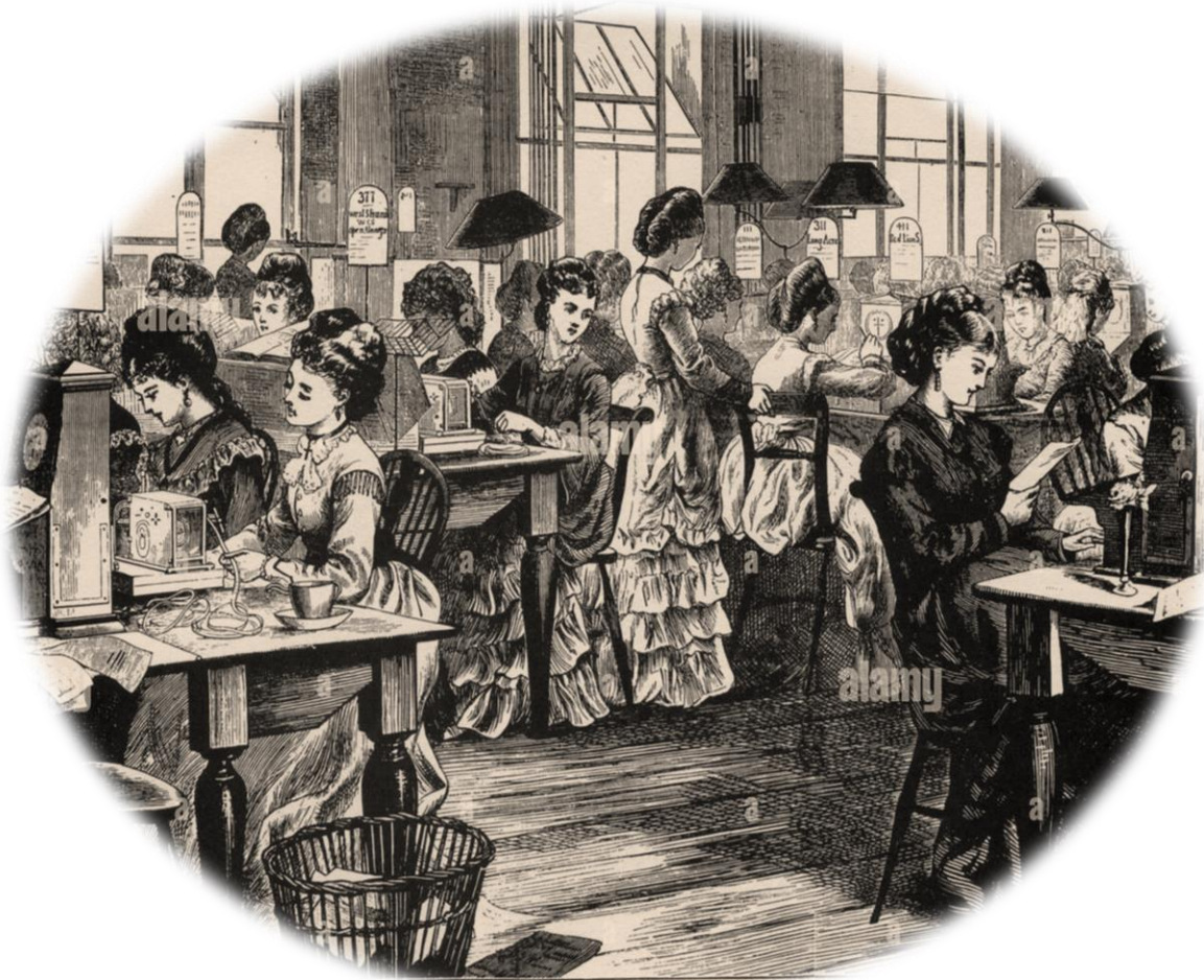
Metropolitan Gallery at the Telegraph Office

LISTS OF THE VARIOUS RACES AND PARTICIPANTS' ODDS WERE LISTED ON THE WALLS, AND RESULTS WERE QUICKLY REPORTED AS FAST AS RUNNERS COULD ARRIVE FROM THE TELEGRAPH OFFICE.