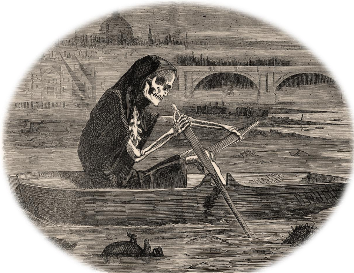
THE "SILENT HIGHWAY" IN LONDON

IT BECAME SO POLLUTED IN 1858 THAT PARLIAMENT WAS SUSPENDED BECAUSE OF THE STENCH.