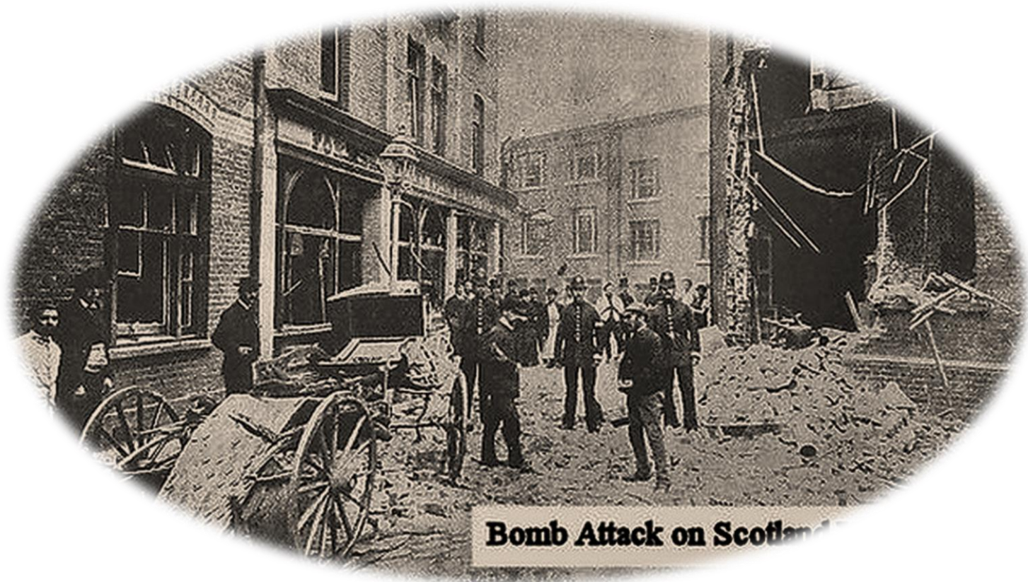
Bomb Attack on Scotland Yard