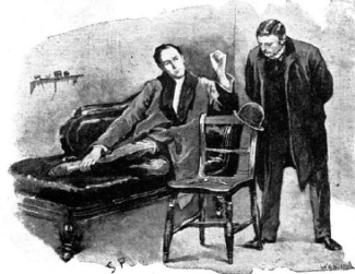
"A VERY SEEDY HARD FELT HAT."

"No, no. No crime," said Sherlock Holmes, laughing. "Only one of those whimsical little incidents which will happen when you have four million human beings all jostling each other within the space of a few square miles. Amid the action and reaction of so dense a swarm of humanity, every possible combination of events may be expected to take place, and many a little problem will be presented which may be striking and bizarre without being criminal. We have already had experience of such."