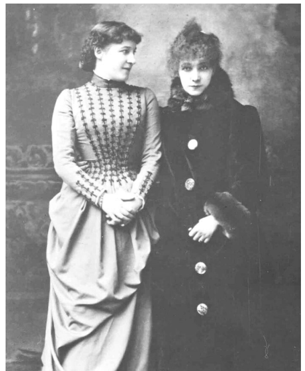
Lillie Langtry and Sarah Bernhardt.

At her apogee, she received widespread public and media interest. She immediately became a trend-setter and socialites shamelessly copied her hats, gowns, and demeanor. Both ladies and gentlemen often made it a point to “just happen” to be at Hyde Park, where the elite would drive on summer afternoons from five to seven, when she would go by in her luxurious carriage following the fashionable route from Hyde Park Corner to Knightsbridge Barracks.